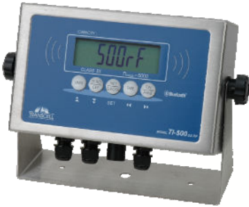
TI-500 RF SS